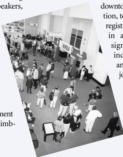
An overview of the Exhibit Hall during the grand opening.

The Exposition was also the largest in NIRSA history. Attendees had the opportunity to visit with more than 450 individuals who represented 140 companies and thousands of products and services. This one-stop shopping venue showcased apparel, architects, facility equipment suppliers, fitness equipment manufacturers, flooring companies, lighting options, scheduling software, sporting goods, turf maintenance and more. The Exposition was also the site for demonstrations for new products and featured CenterStage! where suppliers gave short infomercials.