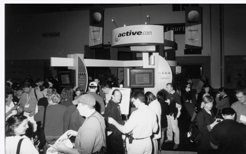
NIRSA's strategic alliance with Active.com was announced during the 51st NIRSA Annual Conference & Exposition in Providence, Rhode Island