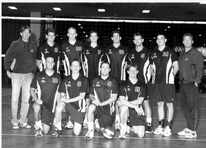
Division III National Champions: University of Arizona "B"

3 seed Kings College from Pennsylvania and Biola, the Bible Institute of Los Angeles as the No. 4 seed.