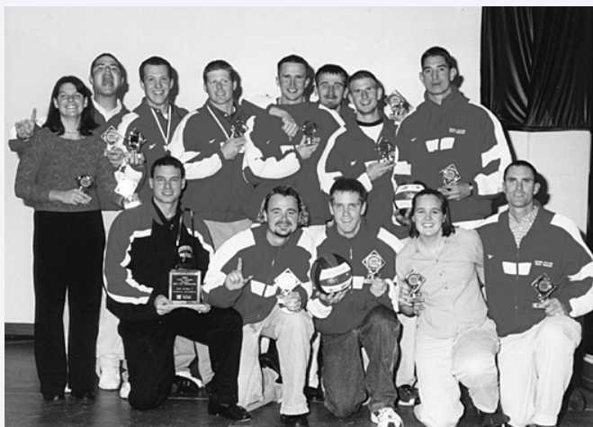
Division II National Champions: Eckerd College